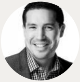
Nominee - Board of Directors