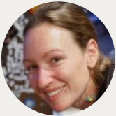
Nominee - Board of Directors