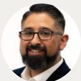
Nominee - Board of Directors