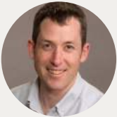
Nominee - Board of Directors